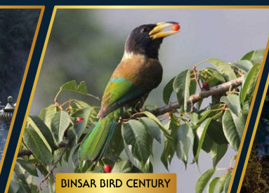
BINSAR BIRD CENTURY