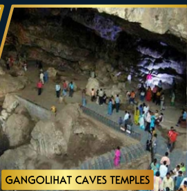
GANGOLIHAT CAVES TEMPLES