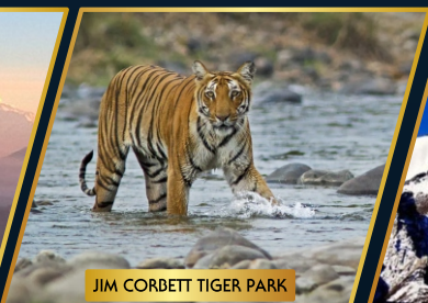
JIM CORBETT TIGER PARK